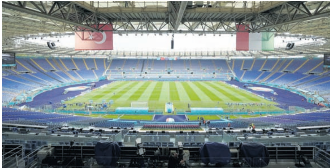
A view of the stadium prior to an Italian national team training session ahead of Friday's Euro 2020 opening group A soccer match against Turkey, at the Rome Olympic stadium, Thursday, June 10, 2021. The Italian government's new sports minister Andrea Abodi has signed a required letter to UEFA supporting Italy's bid to host the 2032 European Championships, said a statement released by the Italian soccer federation on Monday, Nov. 7, 2022

Abodi's letter will be attached to a preliminary bid dossier due at UEFA next week, which is required to include a statement of sup-